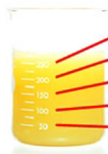
Sweat collected after using the Relax Sauna

Metabolism waste Dioxin Cadmium Heavy Metal Fat