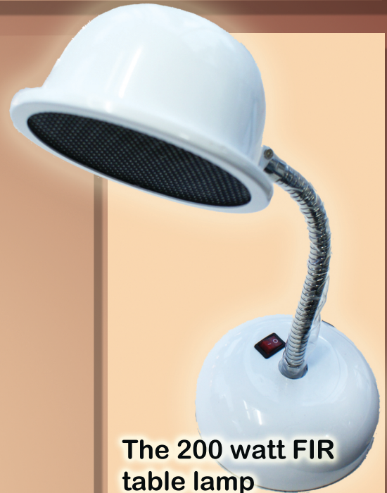
The 200 watt FIR table lamp